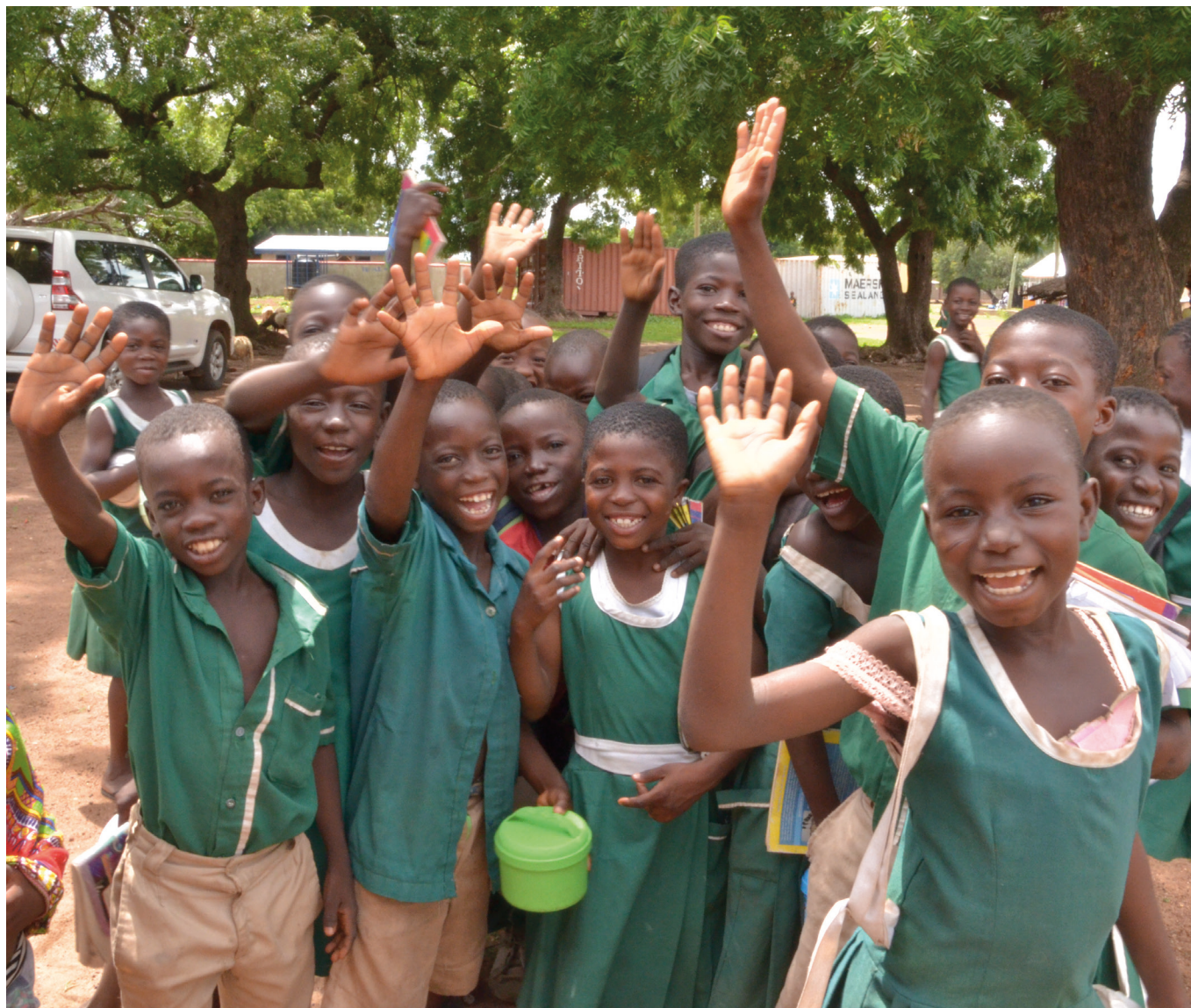
STAR Ghana Foundation belongs to all Ghanaians.