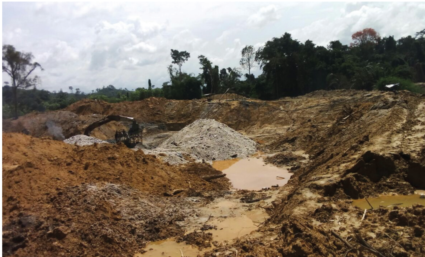
Illegal mining is causing long-term environmental, social and economic damage.