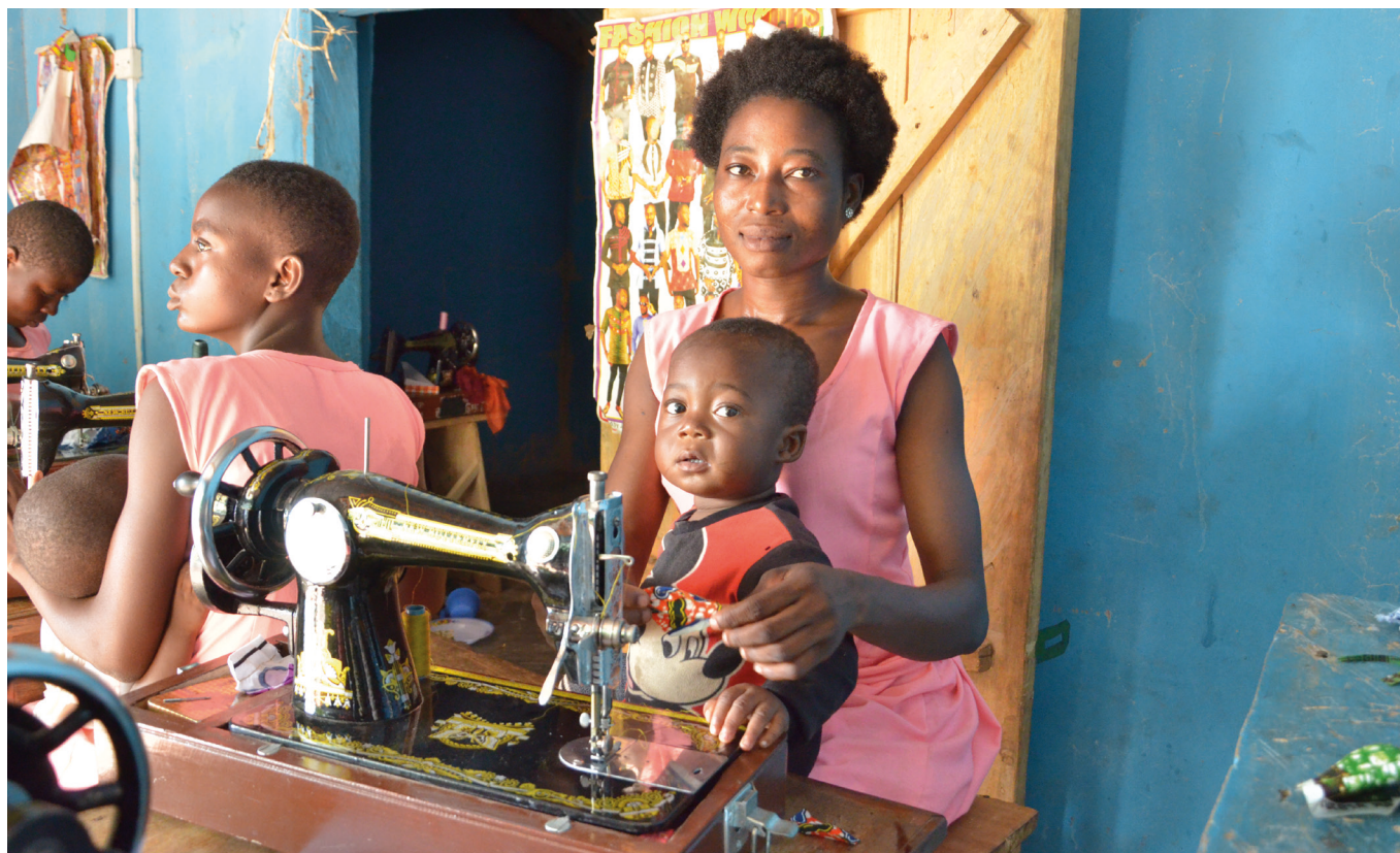
Vocational skills training provided for young women as part of the Let Girls Learn: End Child Marriage project.