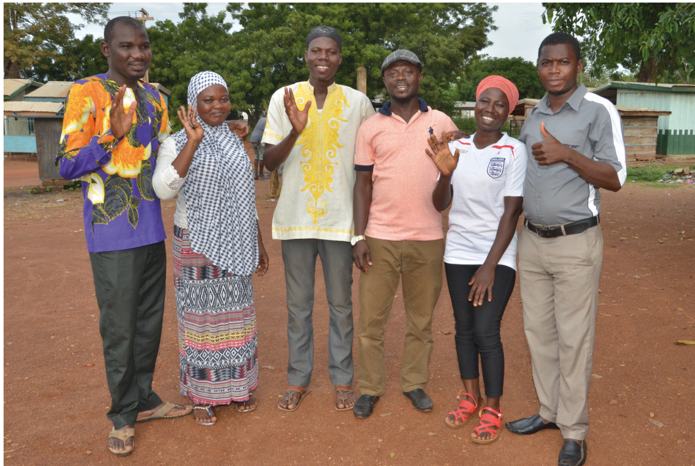
Members of the Youth Parliament from the Yendi Youth Centre have provided a voice to share the views of young people with local authorities.