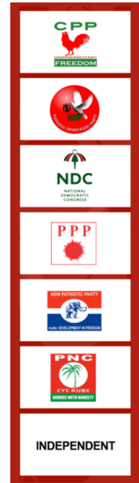
How the political parties appeared on the 2016 Ballot Paper

Firstly, almost all the parties pledged some form of election of MMDCEs in their manifestos. Secondly, the 2015 NCCE survey on issues of interest to the public pointed out that about 70 percent of voters were in favor of the direct popular election of MMDCEs. Interestingly, however, neither the party manifestoes