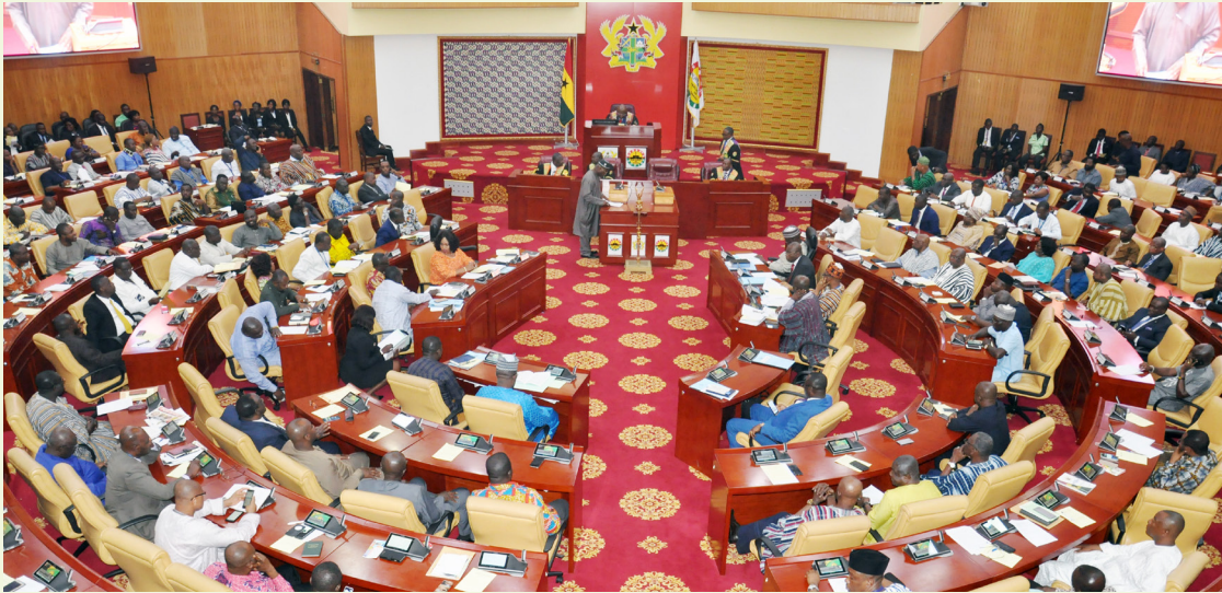
Parliament in session

or not Parliament has a meaningful or cosmetic role in relation to the Executive in the determination of the subject matter for the amendment of an entrenched constitution. Earlier in 2014, this disagreement halted the process of amending the entrenched provisions of the Constitution proposed by the Constitutional Review Commission (CRC).