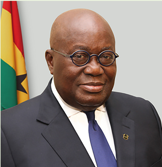
H. E. Nana Addo Dankwa Akufo Addo

power, it would ensure that MMDCEs were directly elected. However, at the end of its first four-year term as the governing party, this pledge to have MMDCEs elected, remained undelivered. It therefore came as no surprise when the authors of the APRM Report on Ghana (2005), included the urgent need to have MMDCEs directly elected by the people in their governance recommendations. The argument for