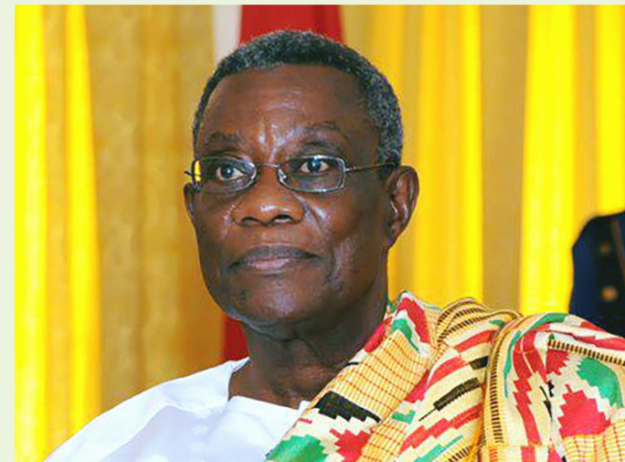
The late President J. E. A. Mills (2009 - 2012)

vary according to whether it is a Metropolis, a Municipality or a District. In Metropolitan areas, Mayors should be popularly elected.