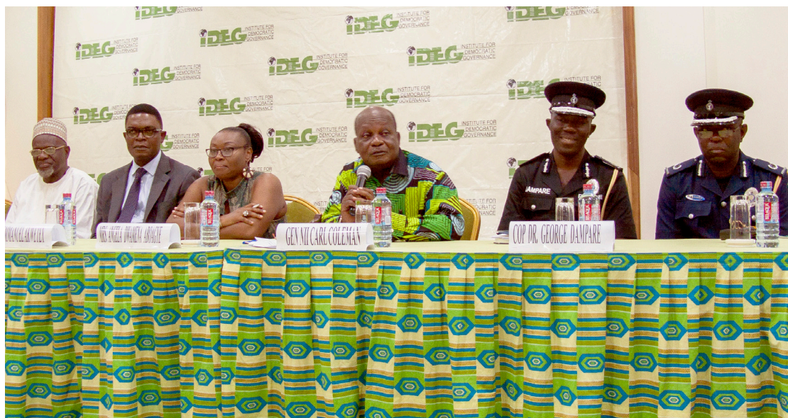
Strategic consultative meeting with the Accra Regional Police Commander on February 2016

current set of MMDCEs will be the last batch of Chief Executives to be appointed under the current system. I have no doubt that the resourceful Minister for Local Government and Rural Development, Hajia Alima Mahama, MP for Nalerigu Gambaga, will be able to shepherd this process to a positive conclusion.”