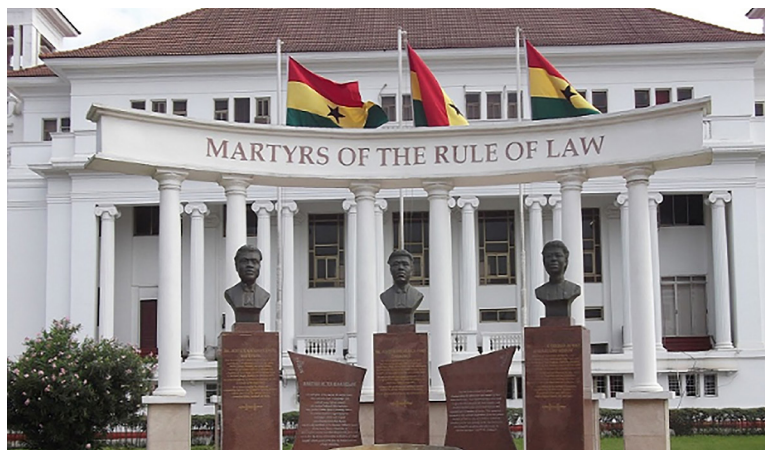
Supreme court of the Republic of Ghana

All the stakeholders including public sector institutions such as the Council of State, Executive, Parliament, Judiciary, Ministries, Departments and Agencies (MDAs) and MMDAs as well as citizens, political parties, traditional