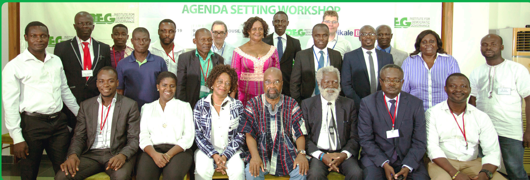
Group photo of representatives of Minority Political Parties at a workshop at IDEG in June, 2016.