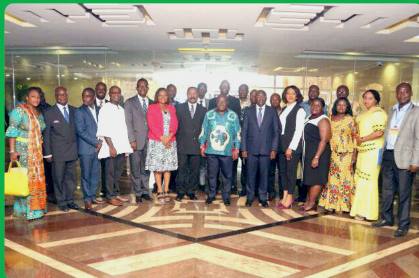
GACC - CSOs first meeting with the President, Nana Addo-Danquah Akufo Addo on April 10, 2017