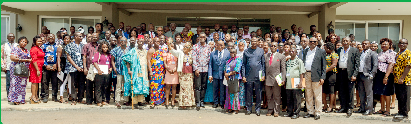
Group photograph of participants at the National Civil Society Forum on June 27, 2018