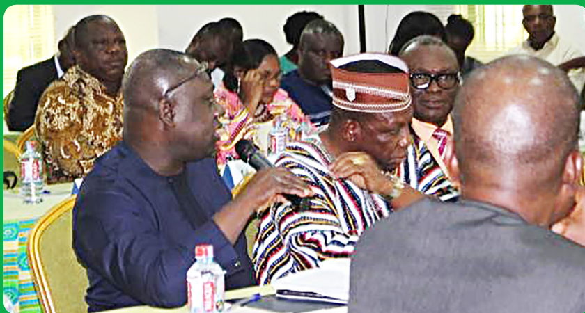
Mr. O. B. Amoah, Hon. MP and Deputy Minister for Local Government and Rural Development and Other Participants.