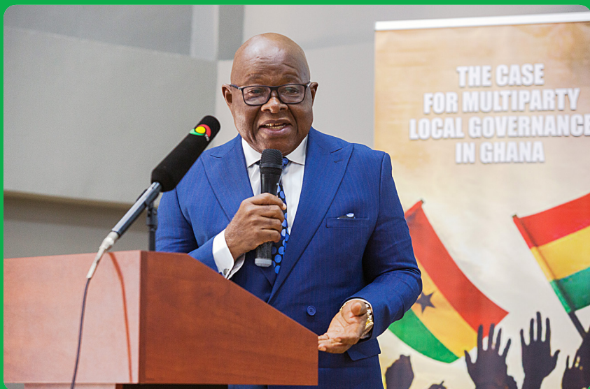
Rt. Hon. Prof. Aaron Mike Oquaye, Speaker of Parliament delivering his keynote address at the IDEG's National Civil Society Organization forum on June 27, 2018