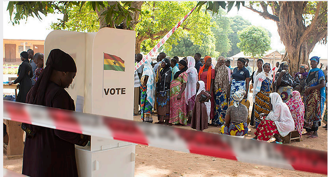
Citizens exercising their voting rights

Local governance reforms have been part of the political and administrative history of Ghana since independence in 1957. Many of the local governance reforms