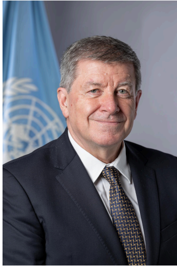
Guy Ryder, Under-Secretary-General for Policy at the United Nations