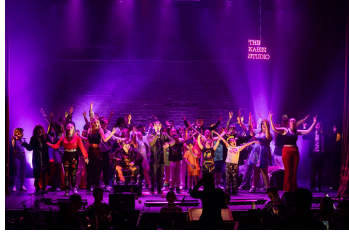
The Kabin Studio , Ireland Youth Group