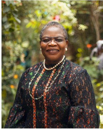
Dr. Obiageli “Oby” Katryn Ezekwesili

President of Human Capital África and Senior Economic Adviser at África Economic Development Policy Initiative (AEDPI)