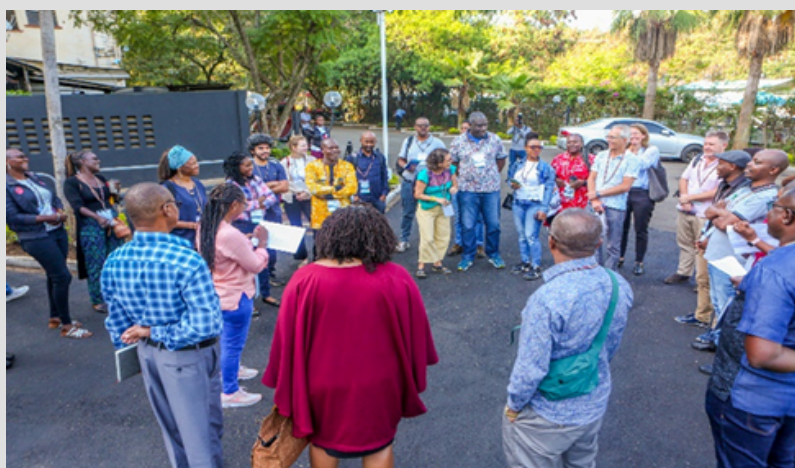
Giving for Change (GfC) Alliance annual gathering participants in a team bonding activity