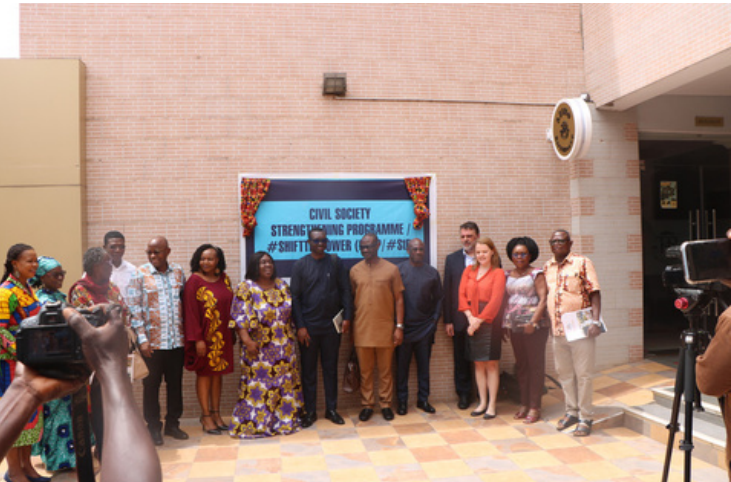
Management of the Foundation in a group photo with partners and officials of FCDO at the unveiling

STAR-Ghana Foundation and the West Africa Civil Society Institute ( WACSI ) are currently implementing the Civil Society Strengthening Programme Shift the Power (CSSP/ #StP ) with funding from Comic Relief and the UK Foreign Commonwealth Development Office (FCDO). This eight-year programme aims to provide long term support to Civil Society Actors (CSA) in Ghana, contributing to their resilience, responsiveness, and effectiveness in delivering the priorities of their constituents..... more