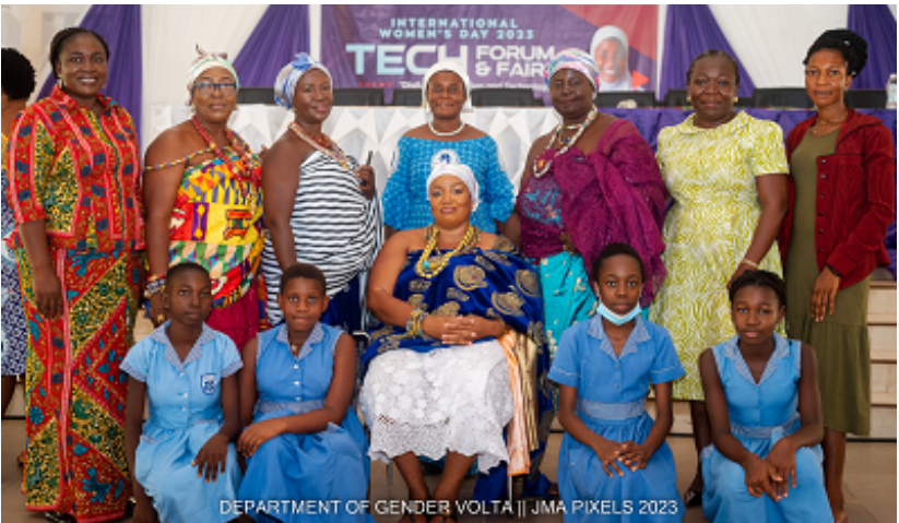
DEPARTMENT OF GENDER VOLTA