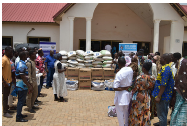
Beneficiaries of the Livelihood Project receiving items at the Pusiga Municipal Assembly(U/E region)

Six border communities in the Upper East Region have benefited from Livelihood Projects; satellite farms with mechanized boreholes, fitted with generators and accessories for constant water supply.