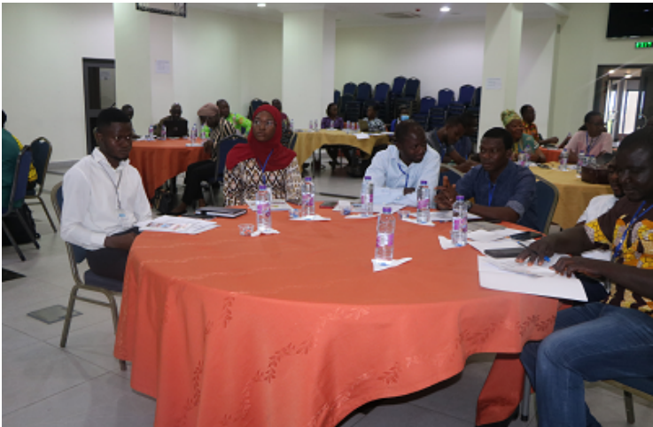
Participants at an orientation meeting for AVID partners

STAR-Ghana Foundation's Actions for Voice and Inclusive Development (AVID) project has held an orientation for partners under the project in Kumasi in the Ashanti Region. The aim was to create an avenue for the partners to better understand the Foundation's ways of working, including reporting requirements and how these relate to the project. Additionally, the workshop provided a platform for identifying synergies amongst the partners to enhance collaboration.... more