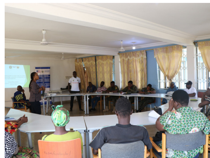
Members of a community dialogue

Community buy-in and support is critical to the success of efforts aimed at helping improve security and or preventing conflicts and strengthening resilience particularly in risk border communities against spillovers and infiltration of violent extremism. In Ghana, the volatile security situation in neighbouring countries to the north has heightened concerns of possible infiltration of extremists and radicalization of vulnerable demographics in border communities. To mitigate these risks, STAR-Ghana Foundation, with funding from the International Organization for Migration (IOM) in Ghana , is implementing the Community Cohesion project in six border communities in the Upper-East region which aims at reducing their susceptibility to radicalization and violent extremism..... more .