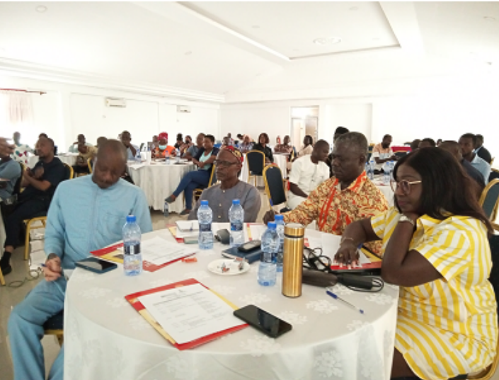
Some catalyst fund participants at an orientation meeting for the CSSP-StP project

STAR-Ghana Foundation and the West Africa Civil Society Institute ( WACSI ) have held an orientation for catalyst fund partners under the Civil Society Strengthening Programme Shifting Power (CSSP- #StP ) in Kumasi in the Ashanti Region. STAR-Ghana Foundation and the West Africa Civil Society Institute ( WACSI ) have held an orientation for catalyst fund partners under the Civil Society Strengthening Programme Shifting Power (CSSP- #StP ) in Kumasi in the Ashanti Region..... more