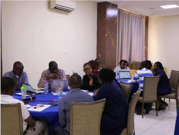
STAR-Ghana Foundation and WACSI staff at a meeting discussing CSSP-StP team onboarding

The search for new ways of working that promote community voice and involvement in social development is imperative and has become an agenda pursued by many development actors, particularly in recent times. In this spirit, STAR-Ghana Foundation and the West African Civil Society Initiative (WACSI), are rolling out a long-term civil society support programme;Civil Society Strengthening Programme-ShiftThePower.... more