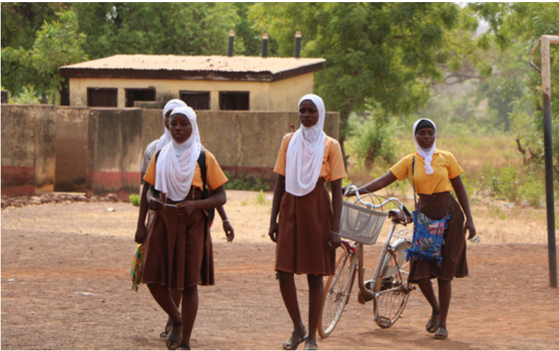
Some female student at the Basic level in the Savannah region

A STAR-Ghana Foundation forum on "Promoting Girls' Education in Ghana" has called on all stakeholders to help promote access to education for all, particularly girls. The participants were of the view that improving access to education for girls was a shared responsibility, adding that government alone cannot provide access to quality education for all.. more