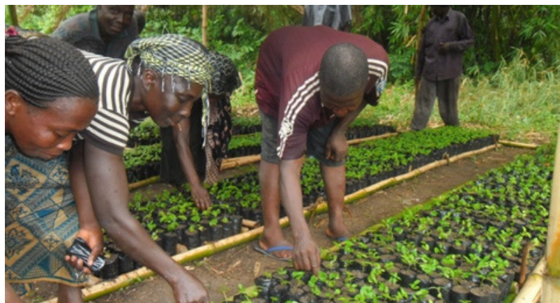
Farmers working on farm

The training, carried out in collaboration with the District Departments of Agriculture of the Kasena-Nankaka and Pusiga districts is part of STAR-Ghana Foundation's Community Livelihood Enhancement project funded by the IOM. ... more