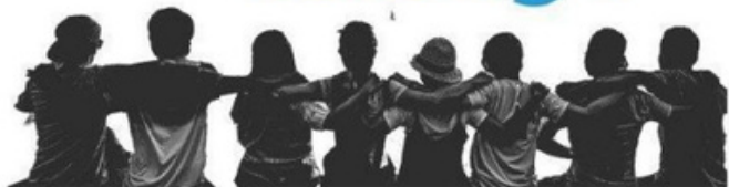
GLOBAL PARTNERS LEARNING AND REFLECTION WORKSHOP

For the first time since its inception, partners on the Giving for Change (GfC) Programme met to learn and reflect on the programme. The five day event, attended by over fifty(50) partner representatives from Africa and Europe also provided an opportunity for strengthening relationships and identify additional opportunities to harness, shift power and scale up the programme... more