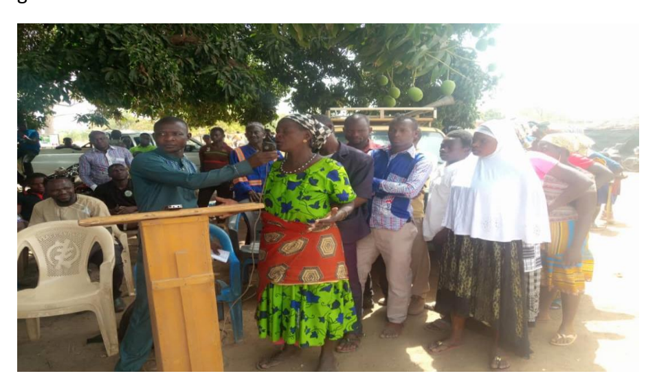
A woman making a submission during the town hall meeting

The live broadcast governance forums witnessed a massive turn out of hundreds of community people. All eight district/municipal Chief Executives availed themselves for the governance forum.