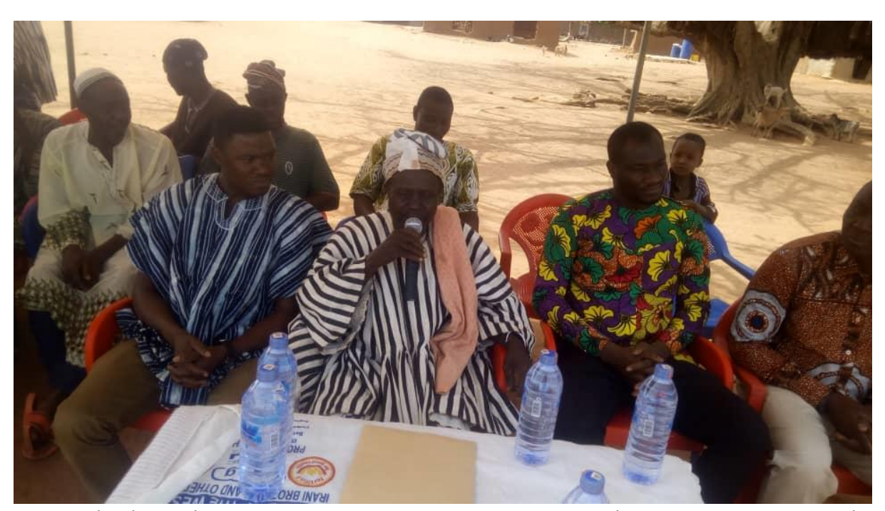
Opinion leader making a statement at Vieri, a community in the Wa West District in the Upper East Region

During the SOD and the live governance forum, the MMDCEs presented information and updates pertaining to developments within their districts. Citizens and local assembly officials on a common platform discussed key developmental issues including lack of access to clean and portable water, absence of health facilities, malfunctioning CHPS compound, high rate of unemployment among the youth, dilapidated infrastructural facilities and the distribution of government-procured fertilizers among the farmers. Other community members who could not be present at the meetings followed the discussions live on radio.