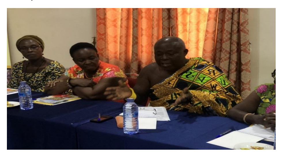
A local chief speaking at one of the sensitisation meetings in Ho

It is worth to note that as a result of the process of observation, young women have gained tremendous knowledge and interest in Ghana's governance system, particularly, the local level system.